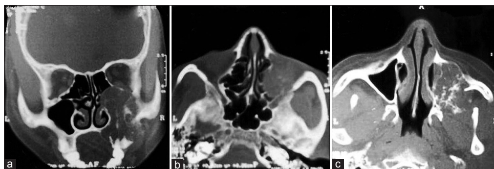
Figure 2: (a) Coronal CT view depicting an expansile lesion of the right maxilla with expansion and thinning of the overlying buccal cortex and involvement of the right maxillary antrum. Erosion of the medial wall of the orbit was also seen (b) Axial CT view showing extension of the lesion into the nasal cavity (c) Axial CT view depicting irregular calcific strands within the lesion